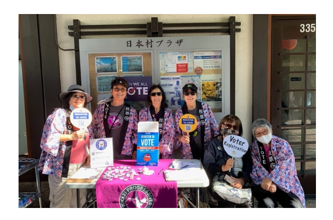
NCRR Members join Nikkei Progressives' Get Out the Vote in Japanese Village Plaza, November 2022