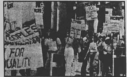
1982 Day of Remembrance Programs

It is now official that the Commission for Wartime Relocation & Internment of Civilians (CWRIC) has been granted an extension through December, 1982 to conclude its findings and make a recommendation on that basis. The evidence (hearings testimonies) would seem to indicate